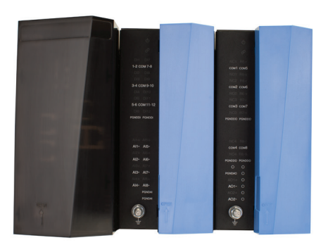
ACE1000 Remote Terminal Unit with covers