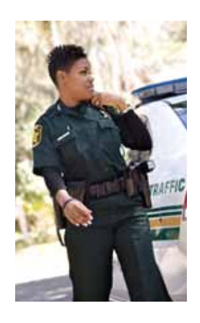
"With the mesh network it's fascinating to see that you have the city acting very innovatively to roll out lots of different applications."

"From an economic point of view, there's no doubt the new technology had an impact," says Jenkins. There are many examples of this. After analyzing the time savings afforded by the new wireless capabilities, the city feels it's achieved the equivalent of putting 18 new officers on the street—and this is because officers can now handle many of their administrative duties while on the street, away from their desk. By taking advantage of the mesh system to eliminate the need