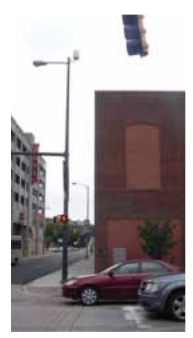
Mesh access points